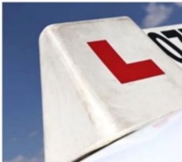
Driving schools were forced to halt lessons in March

Bill Plant Driving School reported a 231 per cent increase enquiries compared with the same day last year and a 10 per cent increase compared with March.